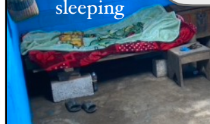
Bed Frame $100 Mattress and Cover $30