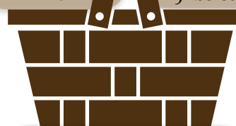
Food Basket $50

Incaparina vegetable oil 2 lbs coffee 5 lbs oats