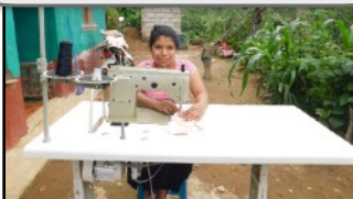
Sewing Machine $550