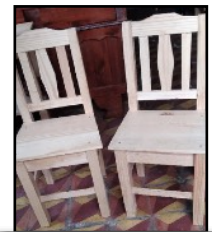
Two Chairs $30