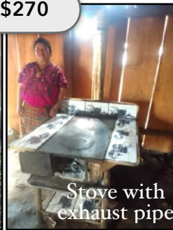
Stove with exhaust pipe