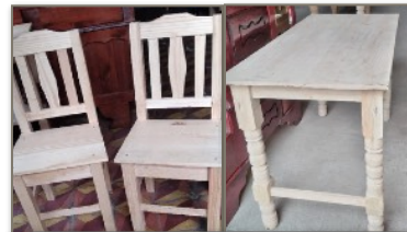
Table & Two Chairs $75