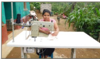
Sewing Machine $500

50 lbs corn 5 lbs sugar 5 lbs beans 5 lbs Incaparina 1 vegetable oil 2 lbs coffee 5 lbs oats