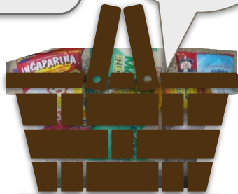
Food Basket $50

50 lbs corn 5 lbs sugar 5 lbs beans 5 lbs Incaparina 1 vegetable oil 2 lbs coffee 5 lbs oats